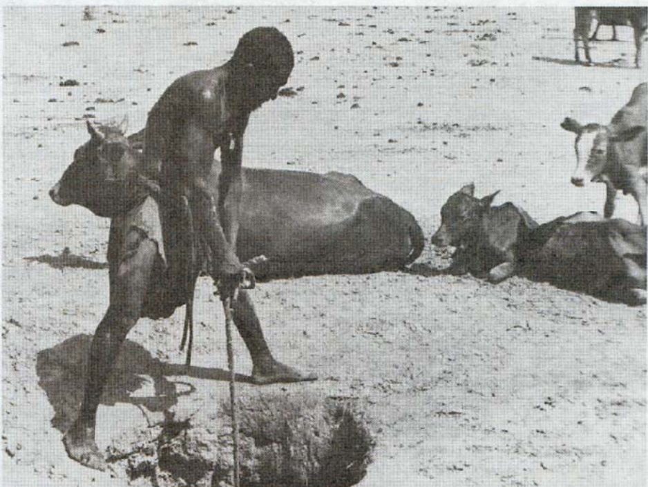
The labour of drawing water from the desert

In the heyday of the Roman Empire, the deserts of North Africa were its granaries. Drilling for sub-soil water can help reclaim the desert, but in the long term a natural water cycle must be re-established. And that means planting trees. Drilling for water in the sub-soil yields only short-term benefits which often lead to the region drying even further. There are deterrent examples of this from the USA, whilst there is evidence (from Italy, for instance) that selective re-afforestation produces undreamt improvements in climate. Dry springs forgotten for centuries flow